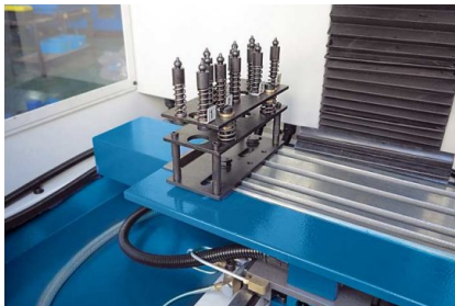
Tool holder with 4 positions