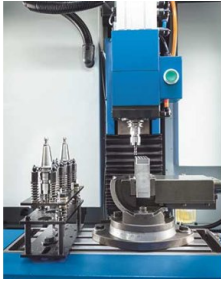
4-station tool changer