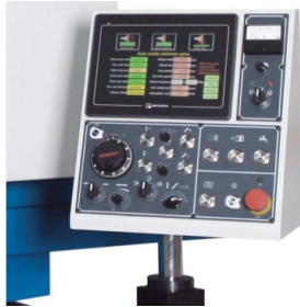
Touchscreen display for easy programming of grinding cycles