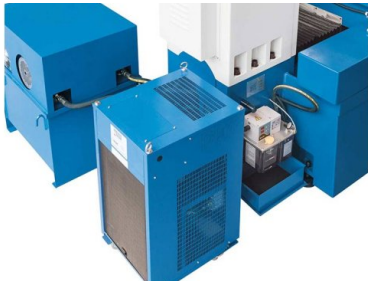
External hydraulic unit and oil cooler ensure thermal stability during continuous operation