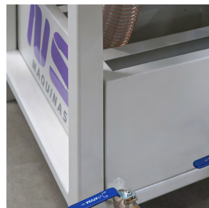
__ tank and water pump: cooling system in a closed circuit