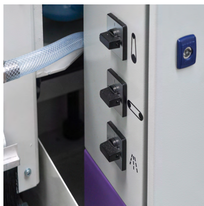
__ quick and intuitive machine control