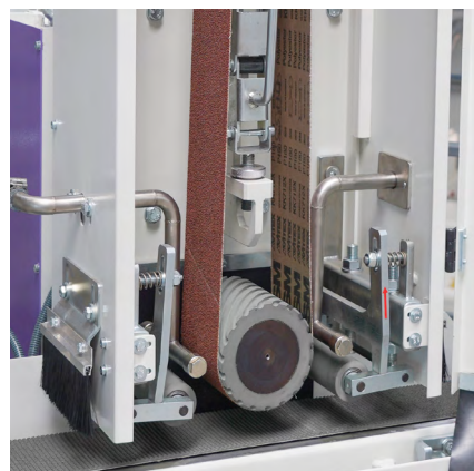
__ abrasive belt head surface finishing with water cooling

__ Manual wheel for thickness adjustment with 1/10mm accuracy