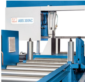
Standard roller conveyor extends the integrated material support area