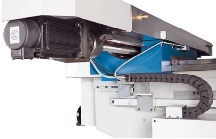
High precision ball-screws