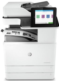
HP LaserJet Managed MFP E72425dn

HP Managed MFPs and printers are optimized for managed environments. Offering increased monthly page volumes and fewer interventions, this portfolio of products can help reduce printing and copying costs. See your HP Authorized Reseller for details.