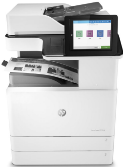
HP LaserJet Managed MFP E72430dn