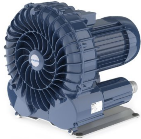
New high performance vacuum pump from TAWI.

TAWI vacuum pumps are designed with three key features in mind; performance, reliability and sustainability. The direct driven pump minimizes friction and unnecessary wear.