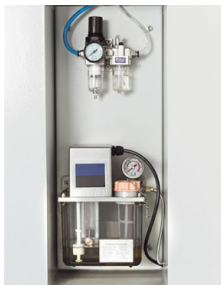
Central lubrication device and maintenance unit