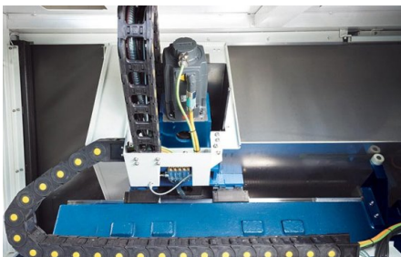
Siemens drive (here X-axis)