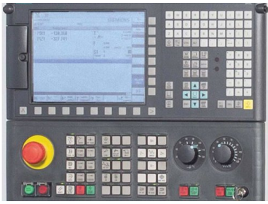
Siemens Sinumerik 828 D - a compact and user-friendly solution for lathes