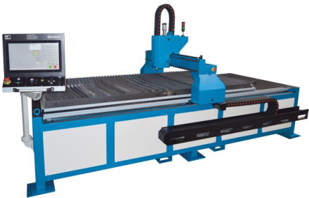
Machine control and operation are done on the main control panel which is located in front of the machine