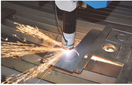
Cutter torch with magnetic coupling and crash sensor