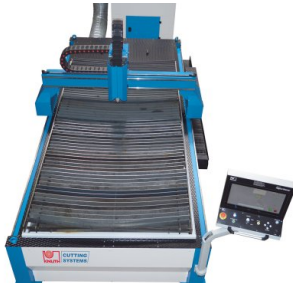
Workpiece weight is supported by catch grid. After their useful life, they can easily be reproduced