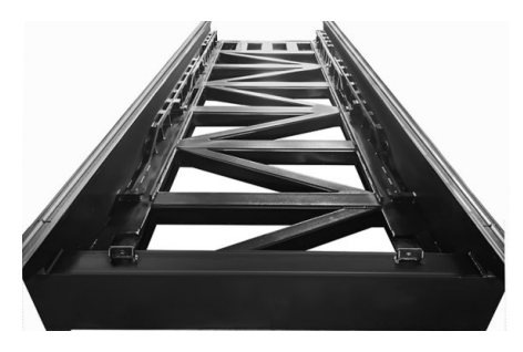
The frame is meticulously welded and thermal treated