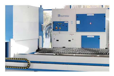
Machine comes standard with a dust collector and filtration unit and has 99,997% filtration efficiency