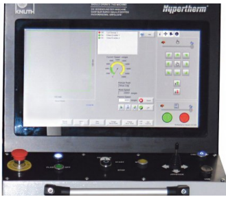
EDGE® Connect is the latest CNC platform by Hypertherm featuring superior reliability, powerful integrated functionality, and is highly customizable