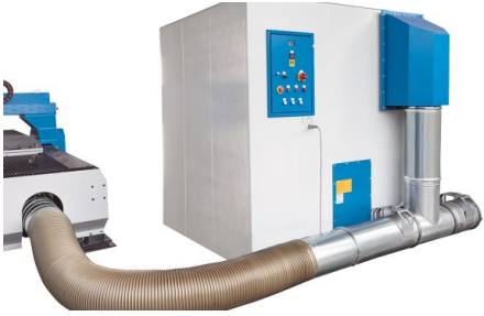
Dust vacuum and filter system available as optional equipment