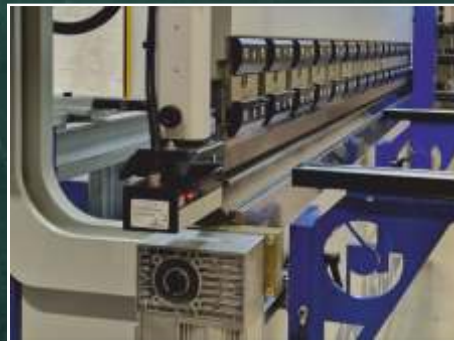
LazerSafe safety device and CNC Crowning