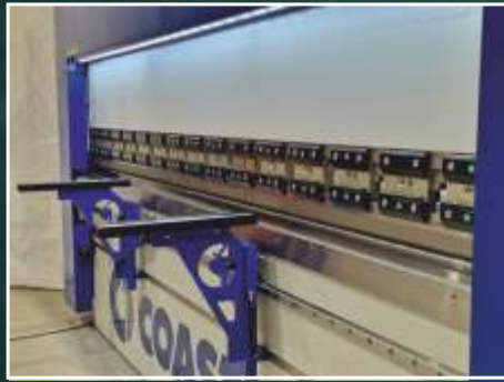
Sliding front supports and CNC-controlled crowning