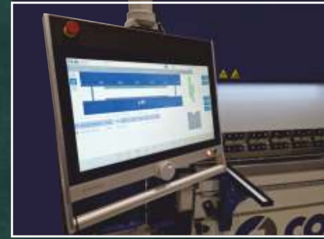
2D graphical touch screen