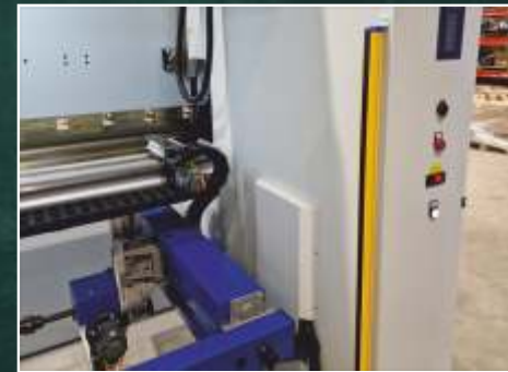
Safety protected back side of machine