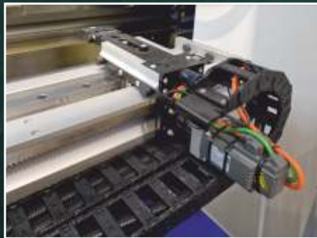
Servo driven back gauge axis...X-R-Z1-Z2