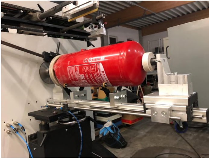
Chuck and counterpoint for fire distungisher