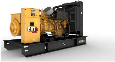
Image shown might not reflect actual configuration