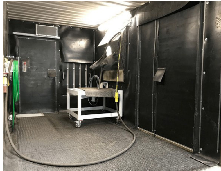
Interior furnishings with special accessories