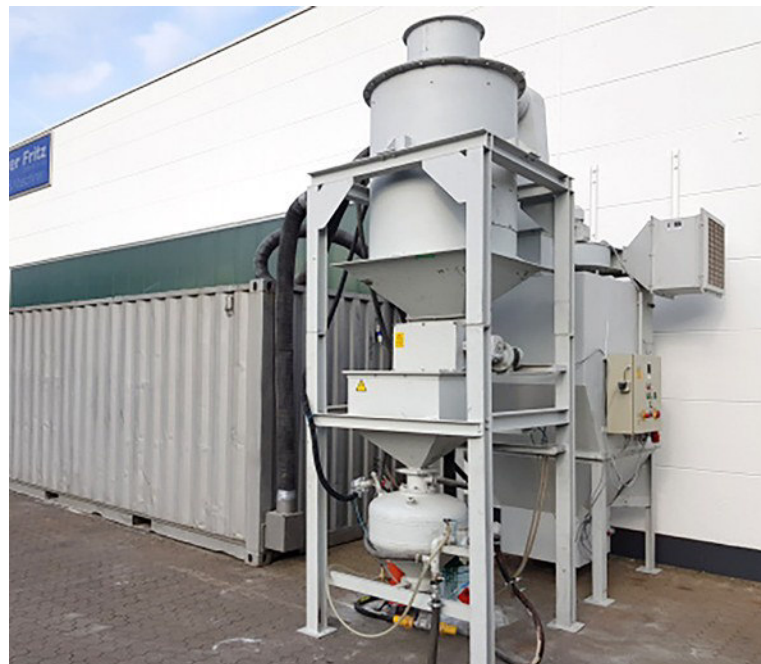
Sandblasting grit recirculation by cyclone separator for a full-area suction floor or side suction channels