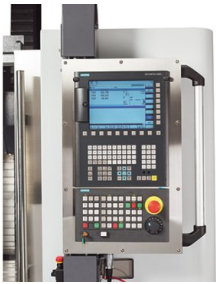
Siemens Sinumerik 828D with ShopMill