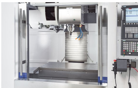
Wide opening front doors