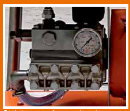
Stainless steel pump-head. Integrated unloader valve.