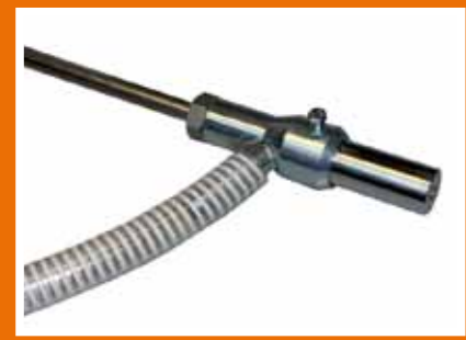
Sand Blasting Equipment