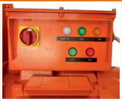
Die cast electrical box with main switch and overload relay.