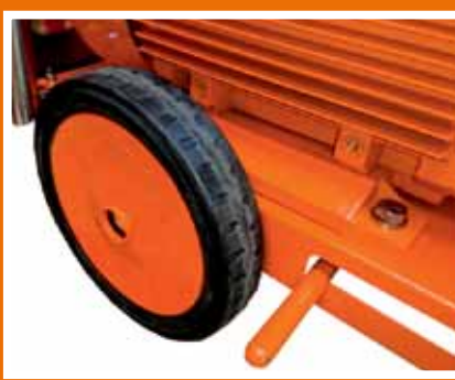
Frame with built in brake and solid puncture free wheels.