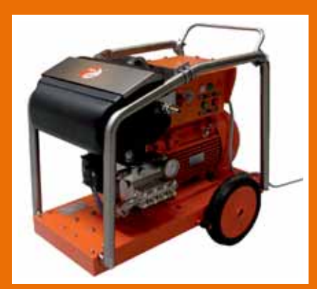
CE20 Compact Slim