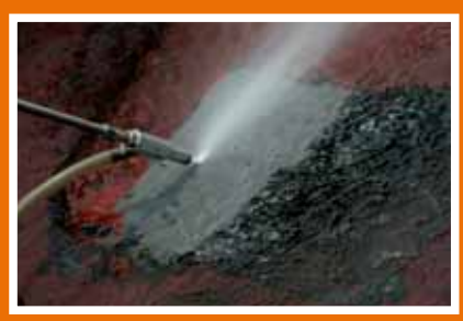
Surface - Sand blasting