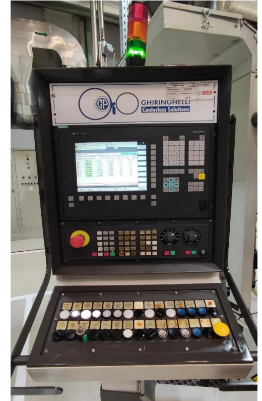
Steuerung (control unit)