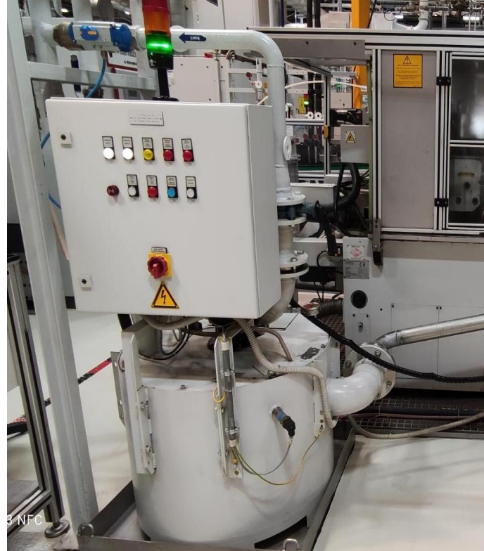
Periph. Rückpumpstat. (return pumping station)