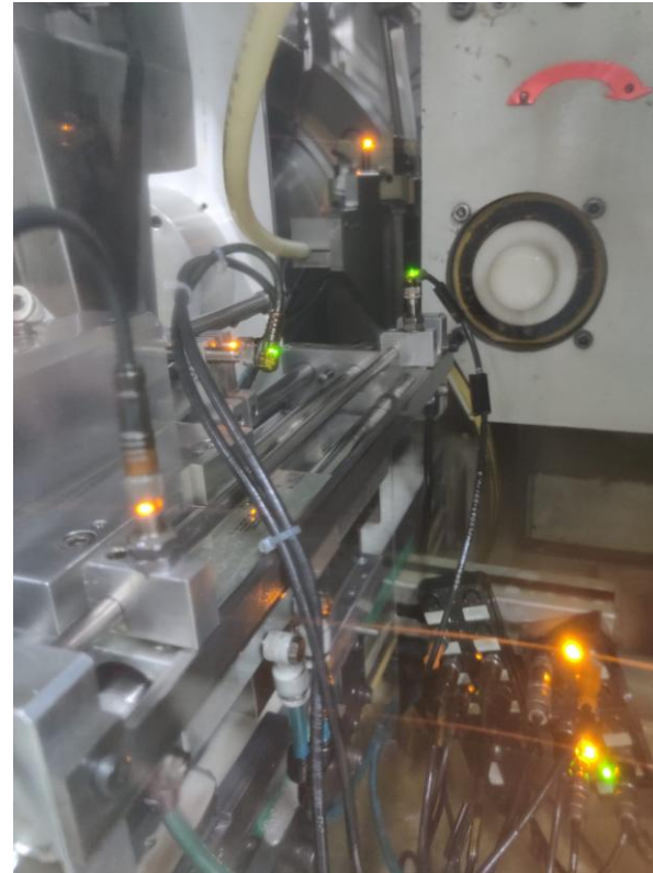
Maschine-Arbeitsraum (workspace of machine)