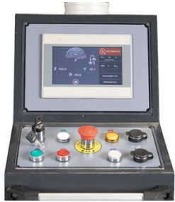
Intuitive controller with large touchscreen and three operating modes: manual/semi-auto/automatic