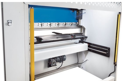
The rear side is protected by light curtains