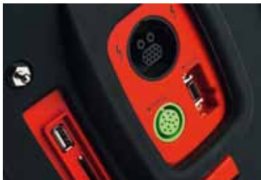
RIGHT SIDE WITHOUT CABLE