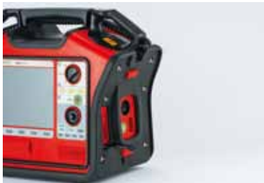
DEVICE WITHOUT POUCHES