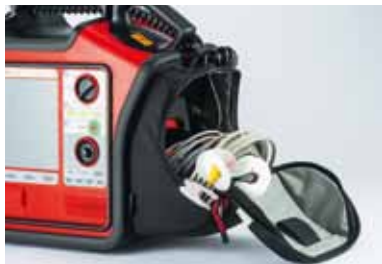
RIGHT SIDE WITH CABLE