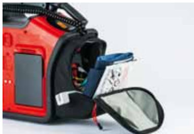
LEFT SIDE WITH CABLE