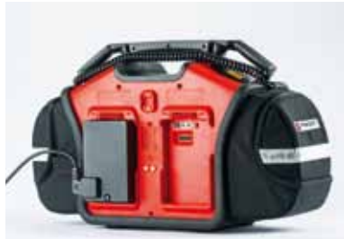
DEVICE WITH POWER SUPPLY W/O BATTERY