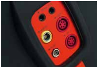
LEFT SIDE WITHOUT CABLE