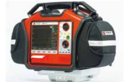
DEVICE IN WALL MOUNT