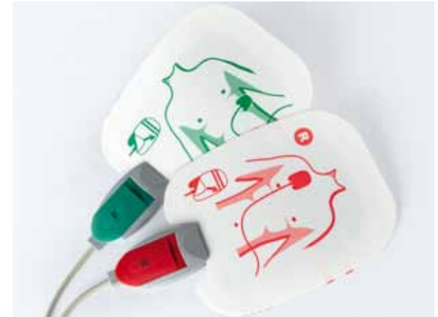
PRIMEDIC™ SavePads Connect