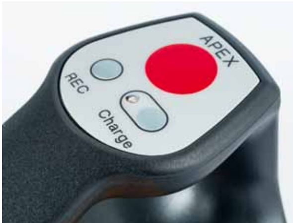
CHARGE / RECORD / PRINT (REC)