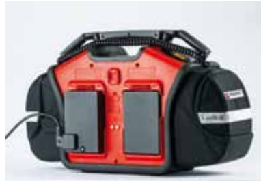
DEVICE WITH POWER SUPPLY WITH BATTERY