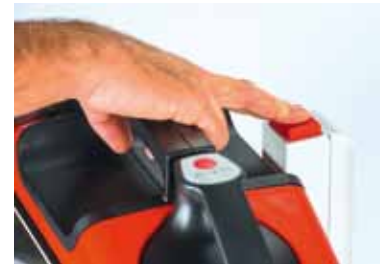
ONE-HANDED RELEASE Step 2