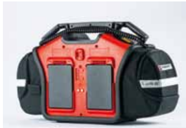
DEVICE WITH 2 BATTERIES