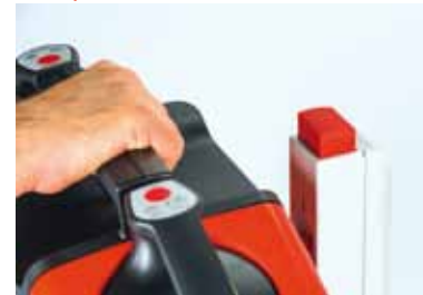
ONE-HANDED RELEASE Step 3