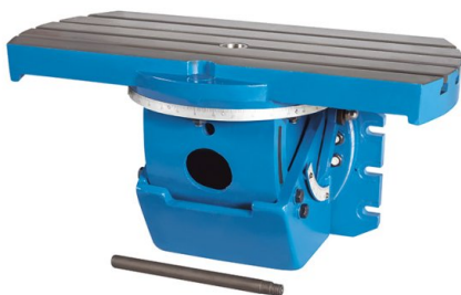
Universal swivel table for FPK 4.3/ FPK 6.3 (253721)