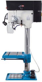
Wide throat and large work table