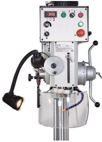
User-friendly and fully equipped