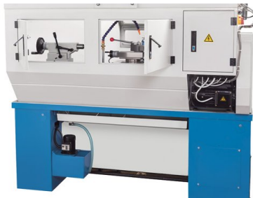
The work area is also accessible through large swinging doors on the back of the machine