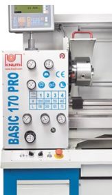
The operator elements are very clearly organized