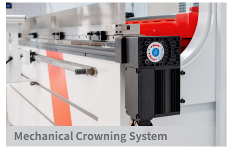
Mechanical Crowning System