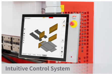
Intuitive Control System

Richer configuration, superior processing performance!