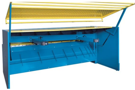
Accessible work area at the back gauge is secured by a swivel door