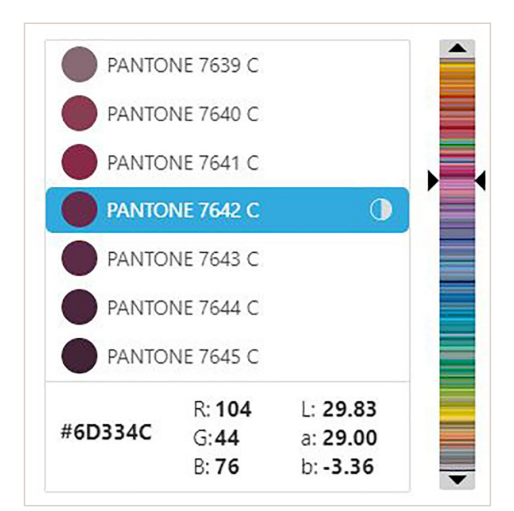
Pantone Colors with color simulation indicator (sample).

Using a simple workflow, Stratasys CMYK colors can be matched to 1,970 printable PANTONE Colors, Solid Coated and SkinTones<sup>™</sup>, helping reduce time and costs as well as ensuring superior color fidelity.