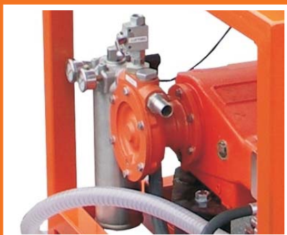
Built-on mechanical feed pump.