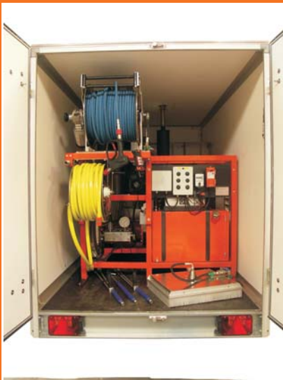
Inside Rear of Trailer