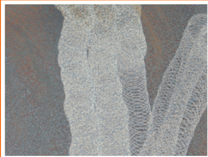
Water Blasting With Rotating Sapphire Jets.