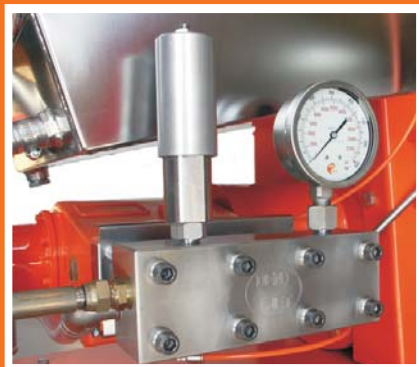
Stainless steel pump-head.