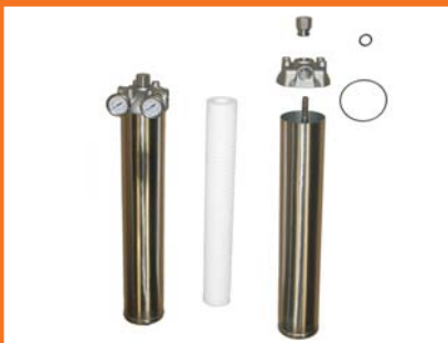
Strainers & Filtration.