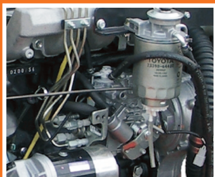
4 Cylinder Toyota Engine