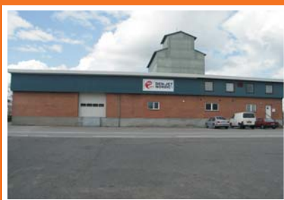
DEN-JET Factory Denmark