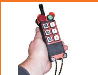
Remote Control, Engine & Hose-Reel