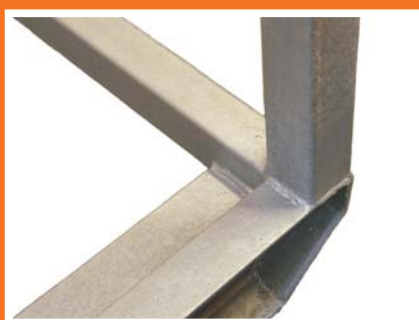
Hot Dip Galvanized Frame