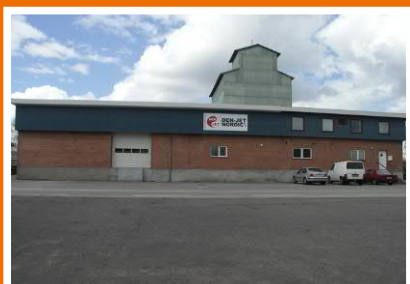
DEN-JET Factory Denmark.