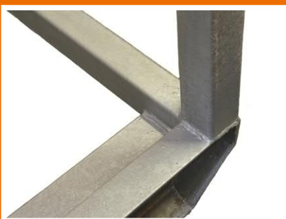
Hot Dip Galvanized Frame.