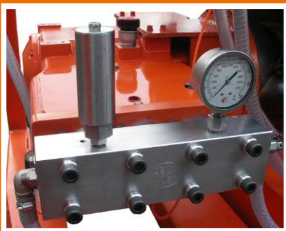
Stainless steel pump-head.