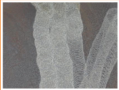
Water Blasting With Rotating Nozzles.