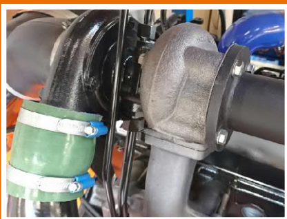
4 Cyl. Turbo Diesel Engine.