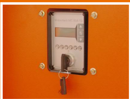
Electronic Engine Controller.