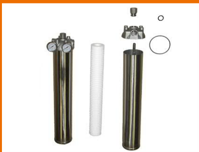
Strainers & Filtration.