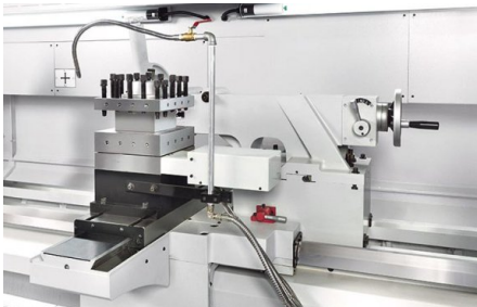
Easy handling: for positioning, the tailstock can be coupled to the support